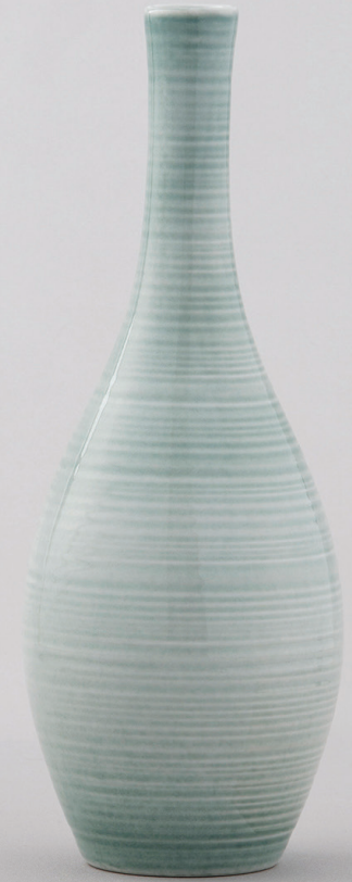
SONET LIGHT GREEN